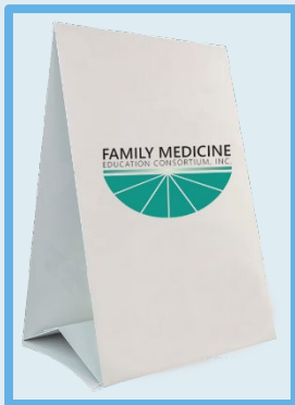
Table Tents/Plenary Chair Drop

Want to stand out and have your brand in front of attendees? Choose this exclusive (1 per plenary) offer. FMEC staff will place your materials on chairs or tables prior to the plenary sessions to be there to greet attendees.